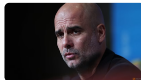
City not dwelling on past failures or Bayern succe...