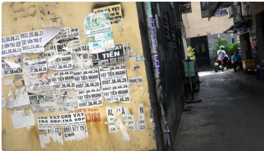
Posters for black credit are glued on the walls of Ho Chi Minh City. The messages say "lend money quickly", "borrow capital, pay on instalments".

In Vietnam, recovery of late debts involves three things: Gentle reminders, perfidy and a dash of death threats to you and your family, say researchers.