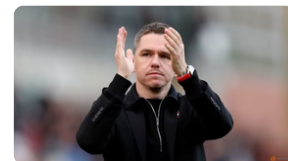
Man Utd boss Skinner criticises ticket allocatio...