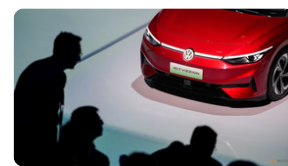
Volkswagen plans 10 more EV models by 2026