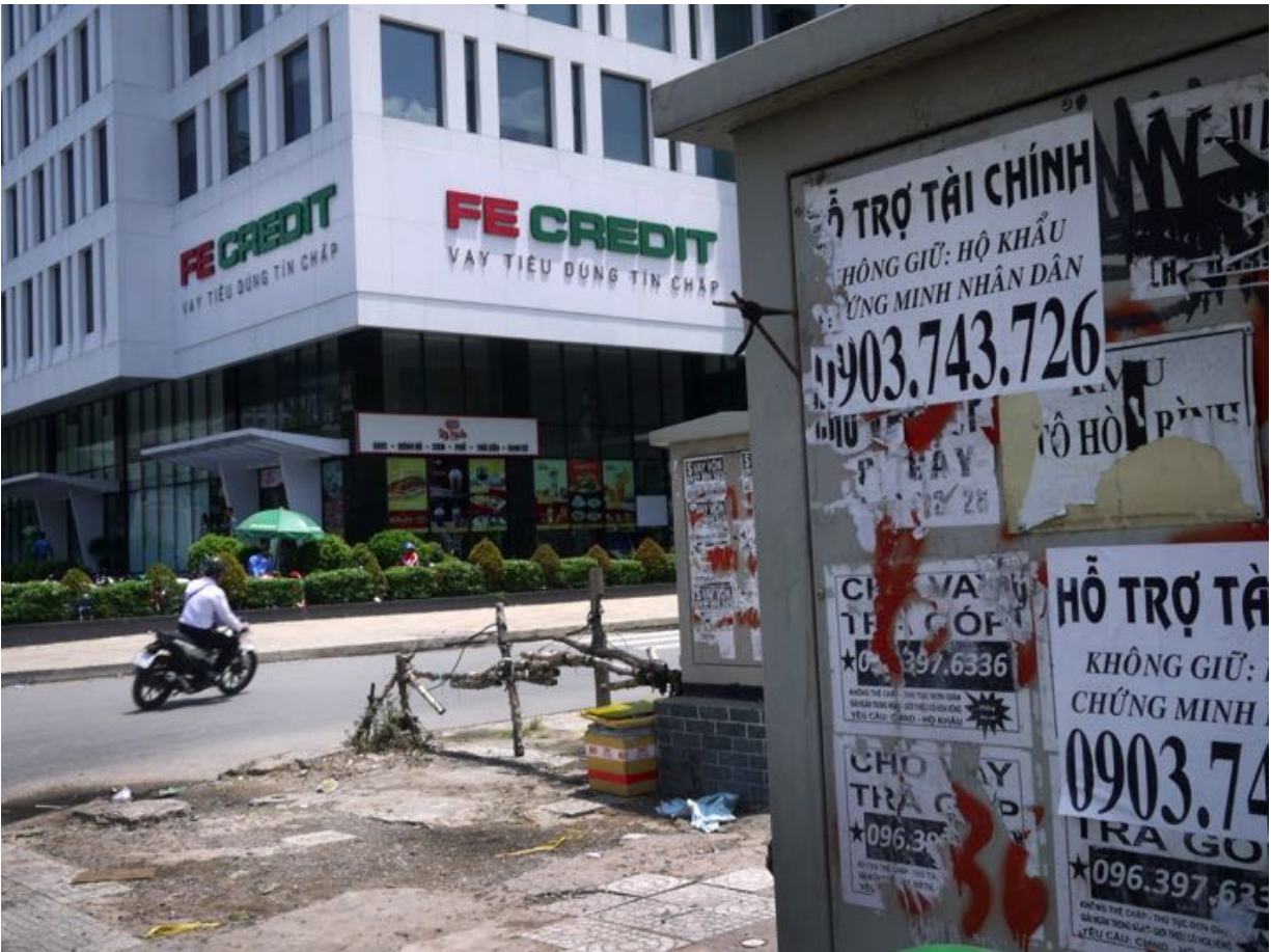
Figure 2: Advertisements for high-interest loans or ‘financial support’ ( hỗ trợ tài chính ) with no requirements for an ID are posted near FE Credit, the consumer finance branch of VPBank.

To sum up, neighborhood and giang hồ moneylenders do not collateralize sexual labor and wages to secure debt as pimps and managers do. Instead, they use harassment to recover loans. However, these two types of moneylenders operate differently. For the former, lending is confined to highly localized social spheres because of their need for intimate knowledge of borrowers and the maintenance of good social reputation. They show flexibility and use verbal harassment in last resort. For their part, giang hồ moneylenders lend money to all sort of borrower which they recruit through social networks and aggressive street and online marketing. A common technique consists of gluing posters on city walls with enticing messages like ‘hello, there is money,’ ‘borrow money quickly,’ and ‘borrow money, pay on installments’ (see figure 2). Giang hồ gangs built a reputation for aggressiveness, instill fear among borrowers and rely on violence to recover loans.