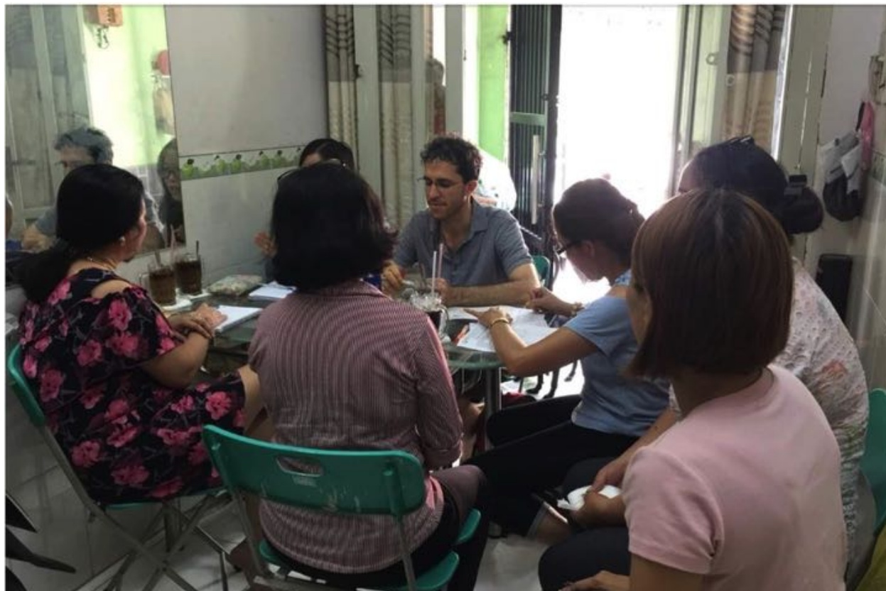
Figure 1: A group discussion with the outreach group 'Riding the waves' ( Nhóm vượt sóng ) (photo taken by a peer educator from the group).